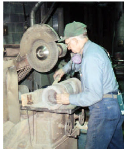
Figure 3-1. Example of older worker engaged in work task

Respiratory functioning also declines with age. There is a decline in function from 15 percent to 25 percent from age 20 to age 65. Oxygen uptake sharply declines after the age of 50, making intense physical activity more difficult. Older workers should not be assigned strenuous work in hot and