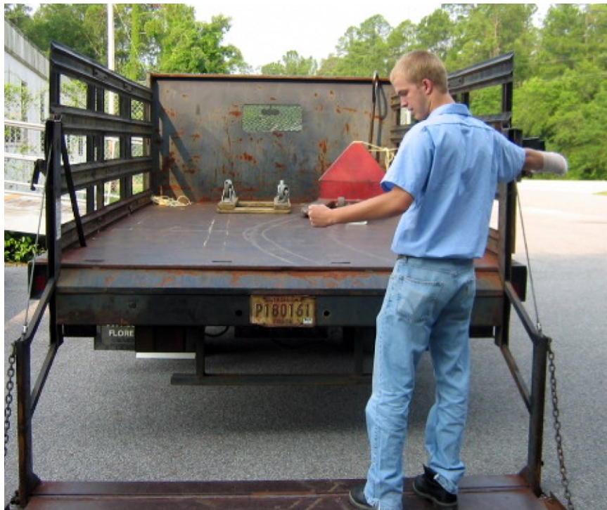
Figure 2-2. Injured worker reenacts the accident, showing how he was positioned on the lift while operating the control switch (note worker's bandaged arm)

On February 28, 2006, at Lawrence Berkeley Laboratory, a subcontract worker caught his gloved hand in a liftgate and suffered a complex fracture of the left ring finger. The worker was closing the truck liftgate during routine transportation