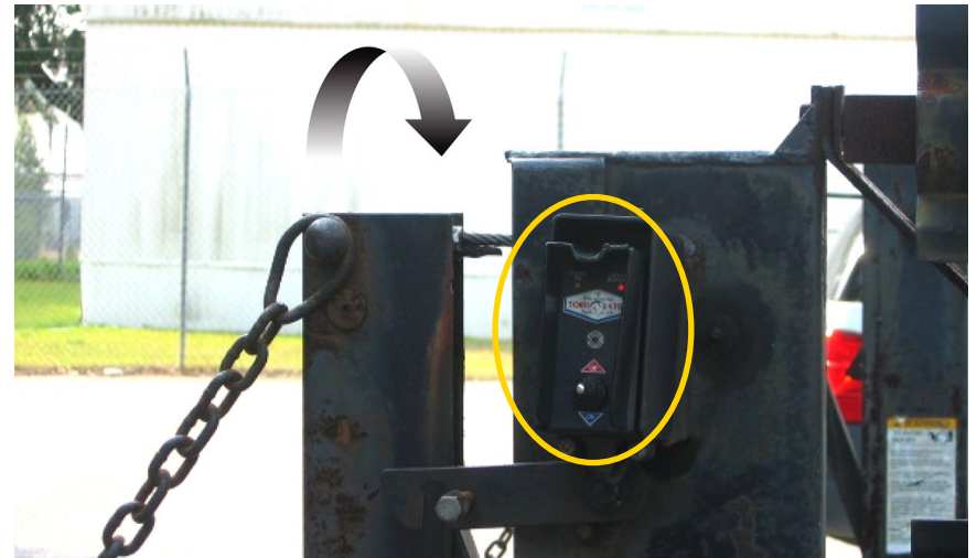
Figure 2-1. Control switch (circled) on right side of the delivery truck (arrow shows the scissor-like movement of the mechanism)

When the pallet jack began to slide, the worker reached down to maintain control of it, while continuing to engage the lift switch. This positioned his right arm in the path of the liftgate operating mechanism. As the liftgate came up, his right