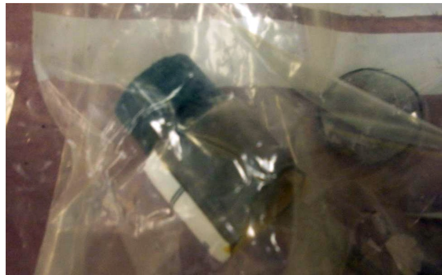
Figure 1-1. Broken glass container inside multiple plastic bags (broken bottom in upper right-hand corner)

The guest researcher, who was working alone in the laboratory and who had received no previous training in handling the sample, was not wearing gloves; and, although he noticed that the bottle was cracked, he continued to handle it. When the bottle broke, spilling the plutonium, he was unaware of the course of action that needed to be taken. He spread