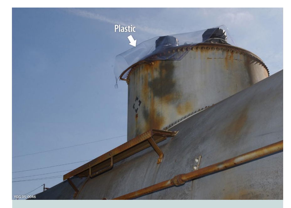
Figure 4-1. Plastic on rail tank car hatch

Figure 4-2 shows the tank car following the accident. A stepladder was placed next to the tank car for access to the lower platform, and the car has fixed ladders to access the upper platform. As shown in the figure, there is a handrail around the midpoint of the tank car that provides stability when workers are on the lower platform, as well as a rung at the top of the access hatch. The upper platform also has a climbing rung, which is approximately 10 feet above the ground.