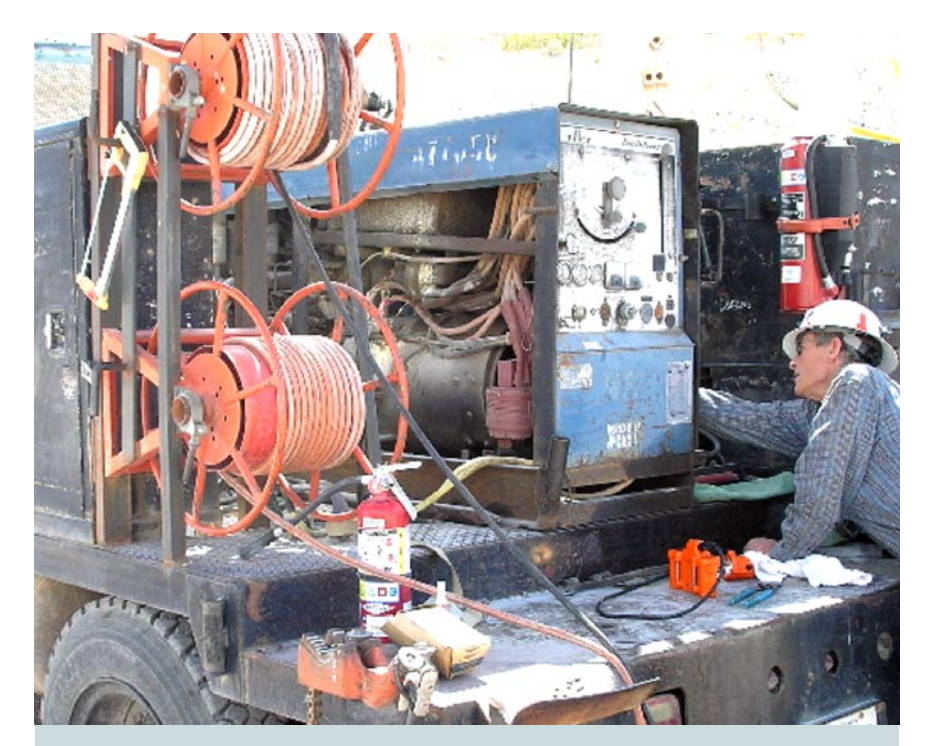
Figure 2-1. Welder/generator (blue) on bed of mechanic truck

The welder/generator, a Trailblazer model manufactured by Miller, was originally purchased in October 1997. In February 2003, preventive maintenance on welding machines was cancelled. Based on an inspection of the equipment, it appears that an electrical short from damaged low-voltage wires started the fire. The age of the welder/generator and the lack of maintenance were contributing factors.