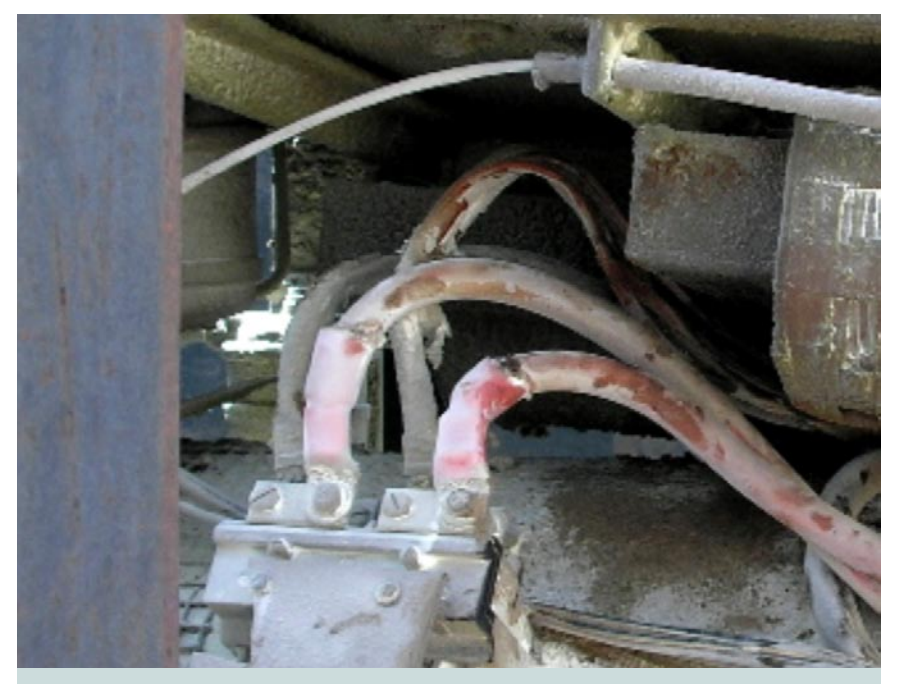
Figure 2-2. Cracked insulation on cables

Investigators also found an excessive buildup of diesel fuel and dust on the welder/generator. The fuel buildup appeared to have come from filling the fuel tank. Fuel on the electrical insulation would have contributed to degradation of the insulation. The accumulation of dust could have caused the buildup of excessive heat in the electrical components.