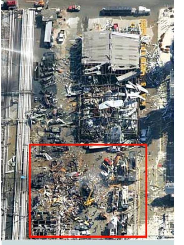
Figure 3-2. Destroyed temporary trailers (red box)