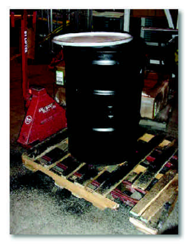
Figure 1-1. Drum containing activated charcoal

There was no packing slip identifying the contents of the 55-gallon drum when it was received from the manufacturer. The material handler suspected that the packing slip was inside the drum and decided to open it and