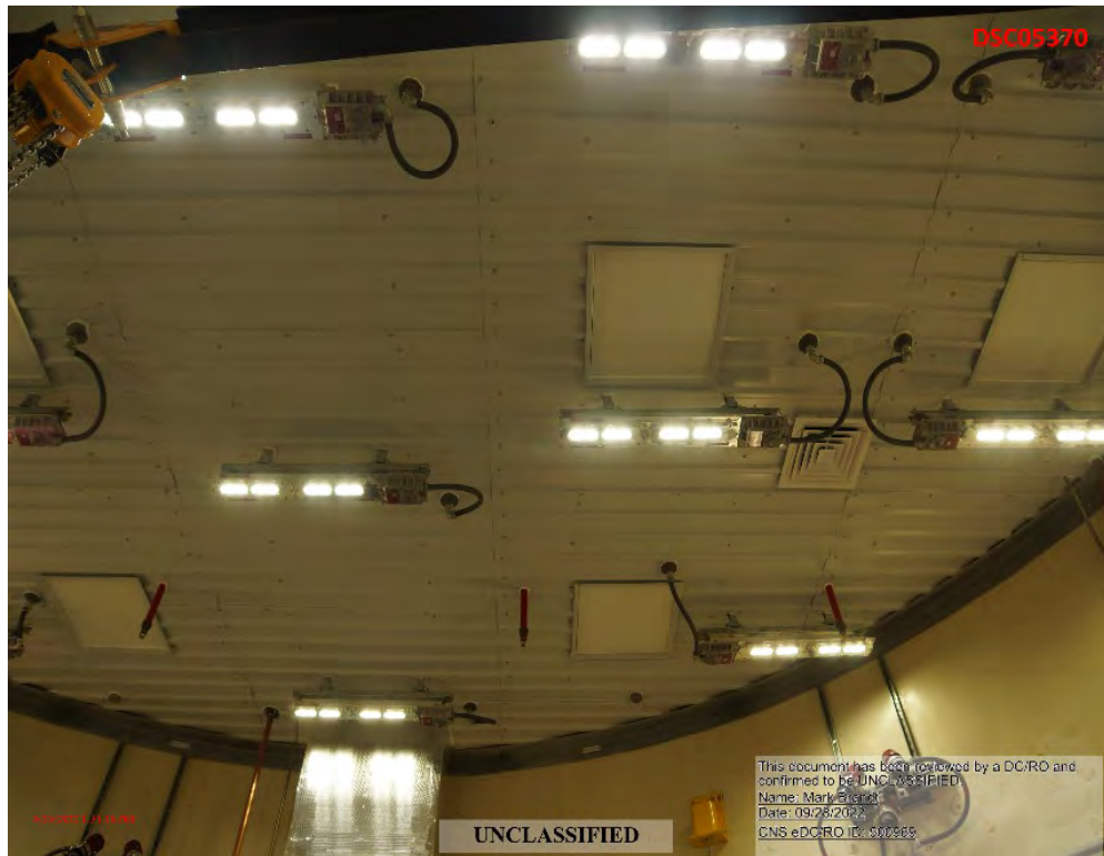
Figure 1. Upgraded False Ceiling within a 12-44 Nuclear Explosive Cell

12-44 Cells —The 12-44 cells are the oldest nuclear explosive cells at Pantex. 12-44 Cells 1 through 6 were constructed in the mid-1950s, and 12-44 Cell 8 was constructed in 1968. 12-44 Cell 1 has not been used for operations since an accidental tritium release event in 1989 [3]. Nuclear explosive cells consist of a round room where the main operations occur, a personnel corridor, equipment and personnel interlocks, and side support rooms for mechanical equipment, special tooling staging, and special nuclear material staging. The Pantex safety basis credits the cell structure as a safety class design feature [4]. The false ceiling in the round room supports the safety class deluge fire suppression system and non-credited ventilation ductwork, electrical conduit and lighting, high explosive contaminated vacuum piping, and compressed air lines.