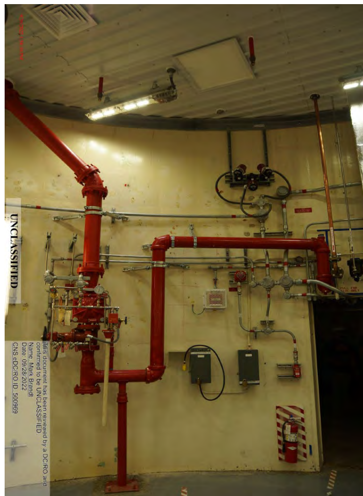
Figure 3. 12-44 Cell Fire Suppression Deluge Riser

The CNS assessment conducted in response to this review identified that the use of cast iron fittings did not meet NQA-1, Requirement 3 for design control. As a follow-up, the Board's staff is considering plans to evaluate the extent to which cast iron fittings exist within fire protection systems at other DOE sites.