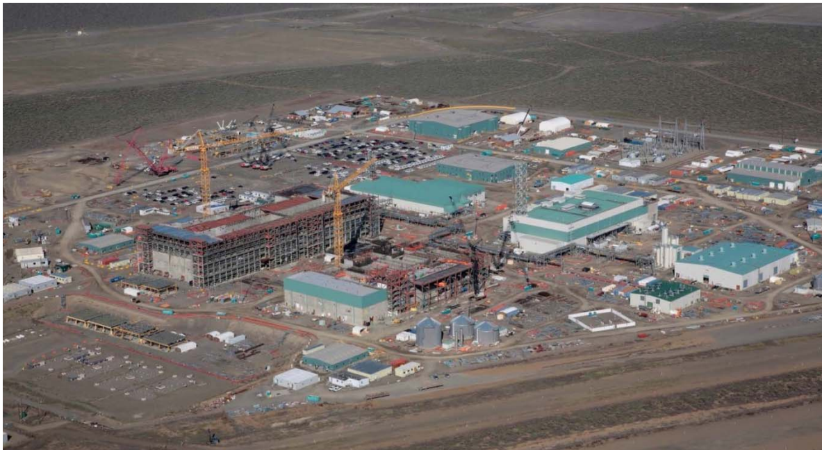
Waste Treatment and Immobilization Plant, Hanford Site

In 2012, DOE restricted engineering, procurement, and construction work on the PT and HLW Facilities because of unresolved technical and safety issues and misalignment between the design and the nuclear safety basis. DOE directed its contractor to address open issues before DOE would authorize resuming engineering, procurement, and construction work for these facilities. On August 19, 2014, DOE authorized the contractor to resume engineering work to finalize the design of the HLW Facility, with limited procurement and construction. However, a considerable amount of work still remains to resolve the open issues.