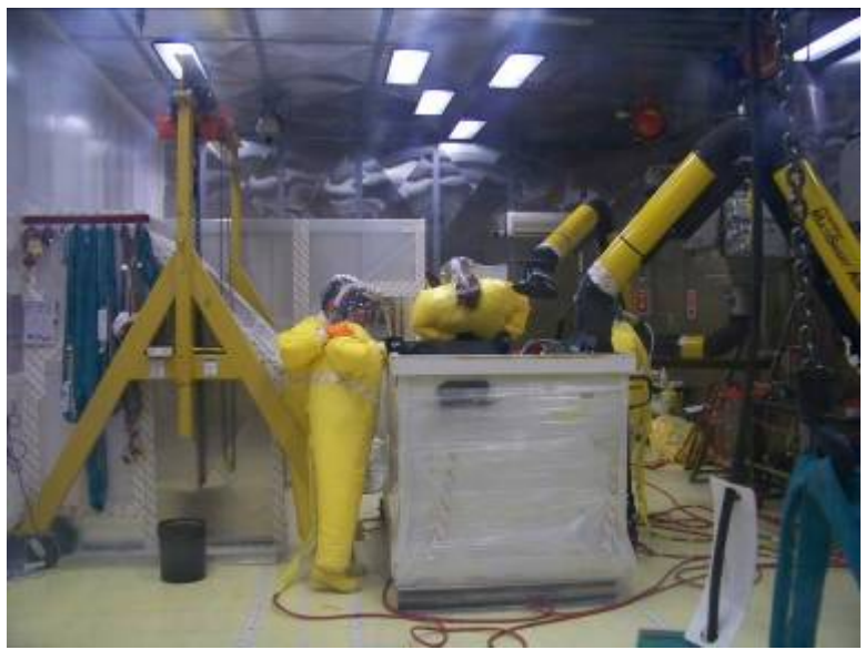
Oversize waste box processing inside the VERB.