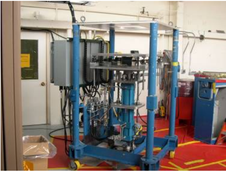
Planet Critical Assembly Machine

pre-action fire suppression systems was also successfully completed for the assembly cells and control rooms. As a result, all four critical assembly machines were relocated from Los Alamos to the Nevada Test Site in late October and early November 2008. The installation of the machines and control systems is in process. The remaining conditions of approval associated with the preliminary DSA were completed and approved. In order to support operations, the CEF Addendum to the DAF DSA and associated TSRs were approved by the Nevada Site Office.