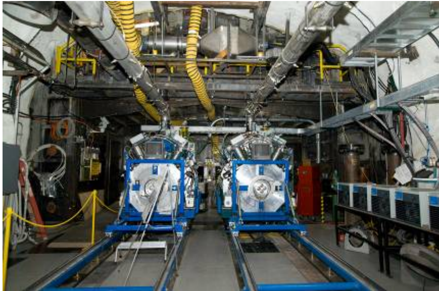
Cygnus radiographic imaging capability at the U1a Complex.