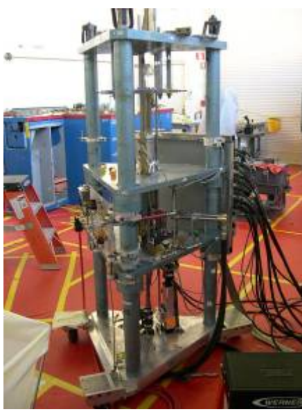
Godiva Critical Assembly Machine