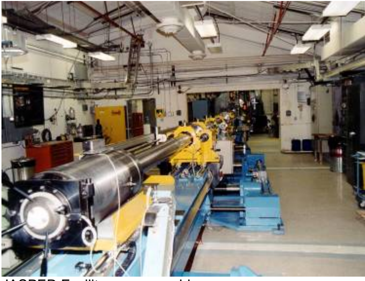
JASPER Facility gun assembly.

In April 2008, the JASPER Facility successfully completed an assessment to evaluate contractor readiness to start operations subsequent to its re-categorization as a Hazard Category 3 nuclear facility. Subsequently, nuclear operations were resumed under an approved Justification for Continued Operations (JCO), and the first plutonium shot was executed on April 30, 2008. The JCO serves as an interim safety basis until a rule-compliant safety basis is approved and implemented in 2009.