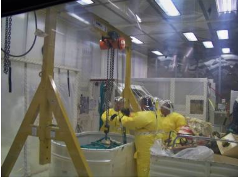
Oversize waste box processing inside the VERB.