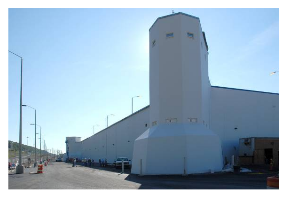
The QE operations were relocated in support of Accelerated Dismantlement and Footprint Reduction initiatives. This project provides improved operational efficiency while significantly reducing security costs, augmenting dismantlement missions, and

Facility construction on the Highly Enriched Uranium Materials Facility project was completed by the August 28, 2008, milestone. Also, the team responded to the DNFSB on project issues and supported several Contractor Assurance System Program-related activities, including project management assessments, independent assessments, external assessments, and surveillances. The project managed 58 active technical and programmatic risks, including labor shortages during construction, delayed turnover of the facility to B&W Y-12 and completion of maintenance analyses, construction subcontractor constructability risks, and installation of the Central Alarm System.