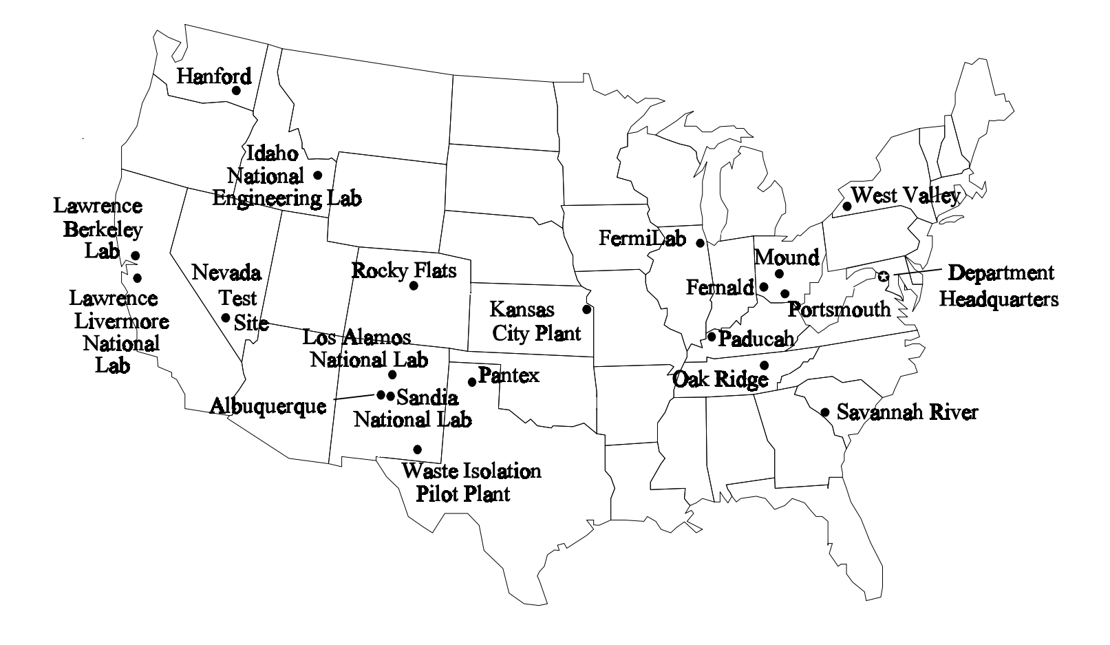
Figure 1 - Major Department of Energy Facilities