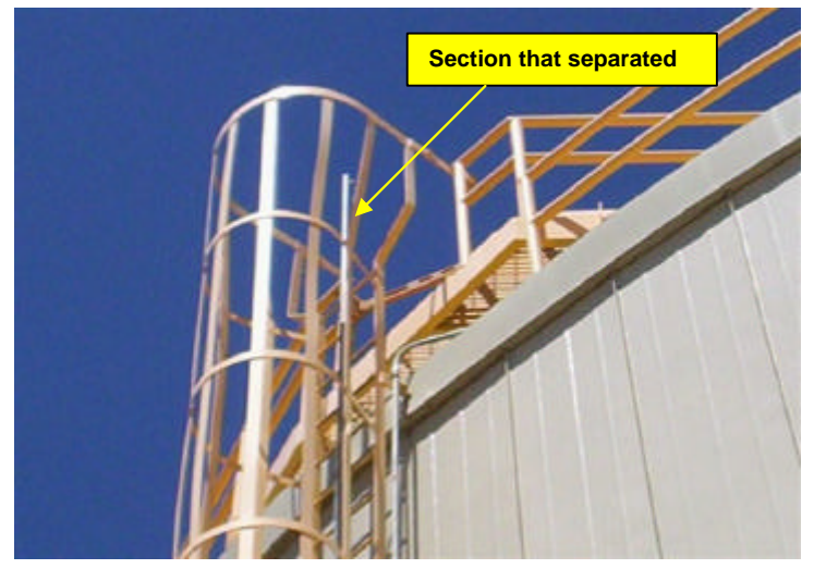
Figure 1. Rail Installation at RTC

(<a href="http://www.antennaproducts.com">http://www.antennaproducts.com</a>), helped to develop a repair for the rail that entails installing a set screw to secure the top portion of the tubing.